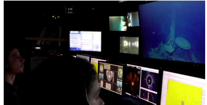
A science team explores the wreck of Humaitá (ex-USS Muskallunge ), an American submarine that served in two navies between 1942 and 1968 (U.S. and Brazilian).