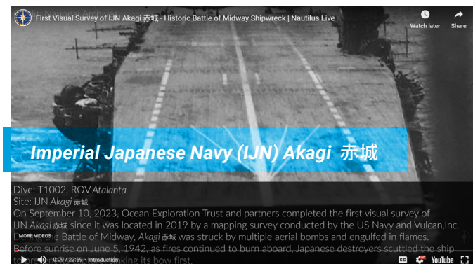
The historic first visual survey and identification of the wreck of the Japanese aircraft carrier Imperial Japanese Navy (IJN) Akagi 赤城, during 1942’s Battle of Midway (24 mins).