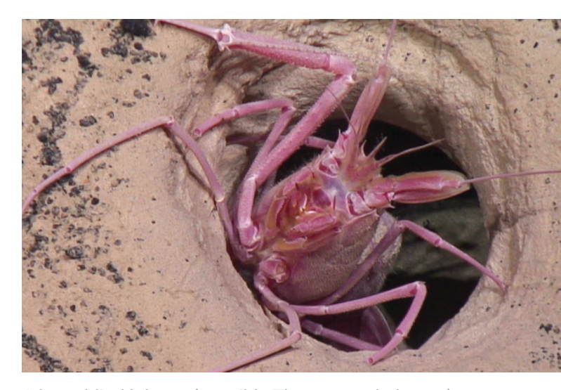
A huge blind lobster (possibly Thaumastocheles sp.) popping its head out of a hole on dive 8. This deep-sea lobster was seen guarding a series of large burrows with claws poised for action.

Seen while exploring a ridge feature at a depth of ~2,500 meters, the fish measured about 10 centimeters long. It is in the same order (Ophidiiformes) as cusk eels, but belongs to a distinct family (Aphyonidae); this is the first time that a fish in this family has ever been seen alive! With its transparent, gelatinous skin, which lacked scales, and its highly reduced eyes that lacked pigment, the fish was truly a remarkable, and ghostly, find.