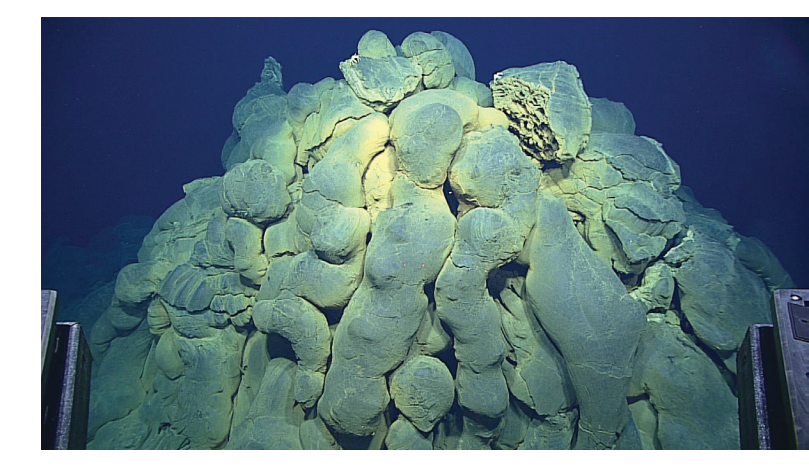
A mount of pillow lava. These pillow basalts form when basaltic lava erupts underwater. Cold seawater chills the erupting lava, creating a rounded tube of basalt crust that looks like a pillow. As the newly erupting lava pushes through the chilled basalt crust, it can form scratches on the pillow surface, called striations.