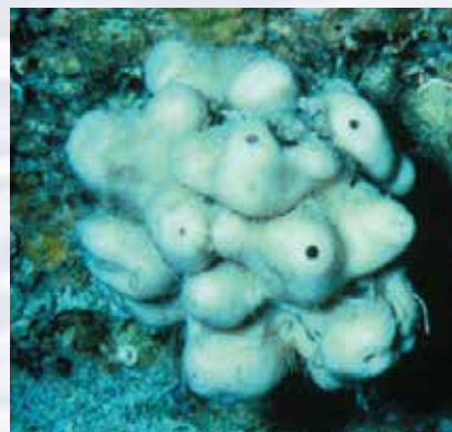
The deepwater sponge Discodermia is now in clinical trials for the treatment of cancer. Image credit: NOAA.

http://oceanexplorer.noaa.gov/explorations/03bio/background/plan/media/discodermia.html