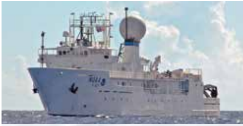
NOAA Ship Okeanos Explorer : America's Ship for Ocean Exploration. For more information, see the following Web site: http://oceanexplorer.noaa.gov/okeanos/welcome.html