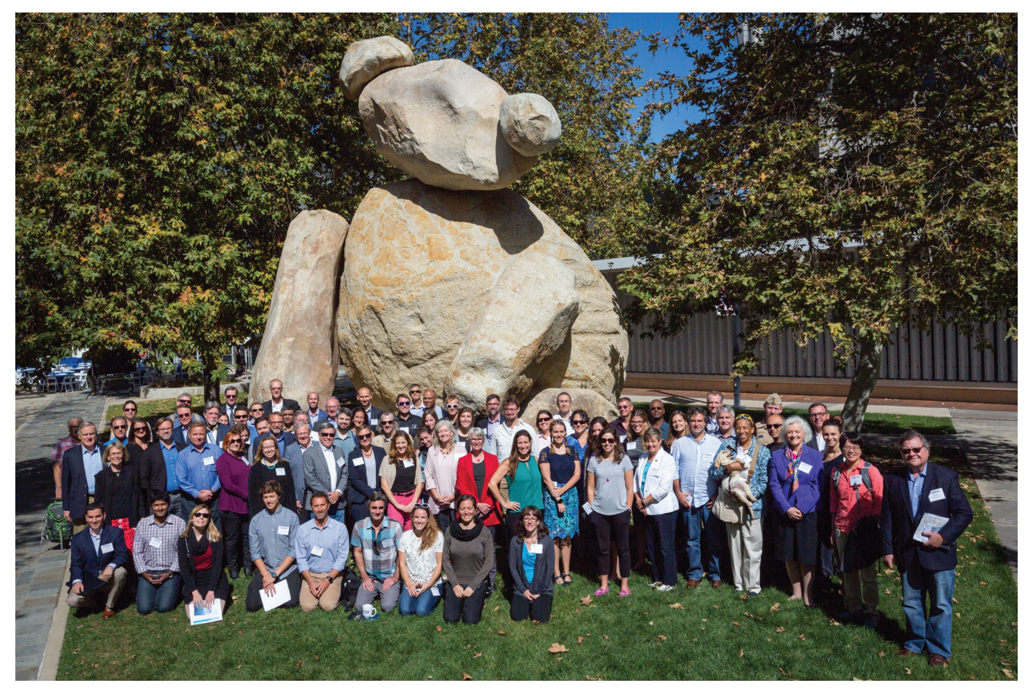
On October 21-22, 2017, nearly 125 experts in fields including ocean exploration and data science came together for the fifth annual National Ocean Exploration Forum at QI, a division of the California Institute for Telecommunications and Information Technology.