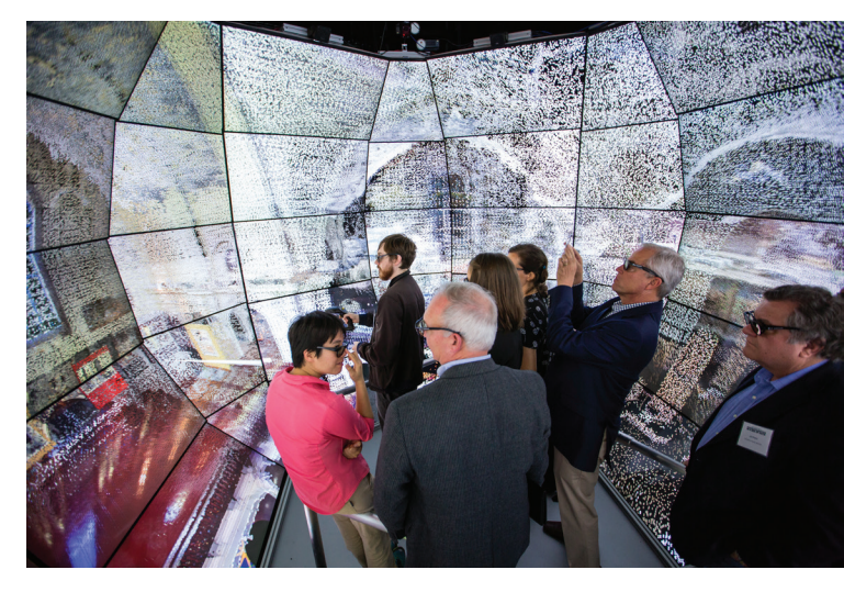
National Ocean Exploration Forum participants explore the SunCAVE, an immersive environment that allows for near-360 degree presentations of video and data.