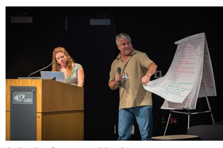
On Sunday afternoon, each breakout group was given an opportunity to present the results of their discussions to the full Forum group.

One common theme among the breakout groups was the need to make ocean exploration more accessible and inclusive by developing new tools and technologies to lower the cost of ocean exploration; creating more/better opportunities for virtual exploration opportunities; and making data available to the public sooner, to spur innovation and take advantage of open source and citizen science opportunities. Participants also noted that the need to rethink how collected data are managed, both during acquisition and for long-term archiving.