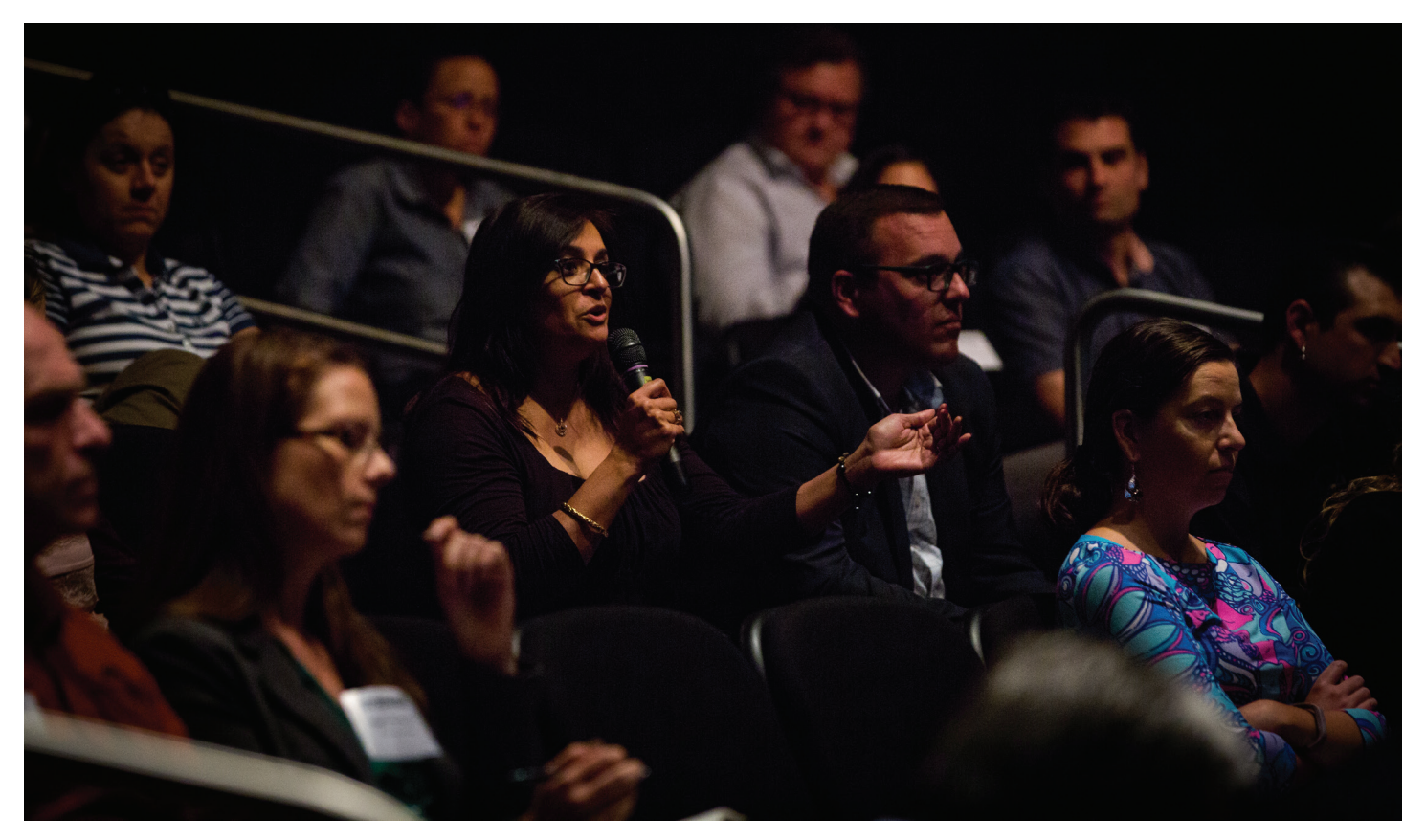
Participants asked questions during the concluding panel, titled "What Should We Do Next?"

NOAA should leverage the abilities of those who already work in ocean exploration and data science. The agency needs to invest more in the curation, production, and presentation of data. NOAA should continue to refine and clarify priorities, then communicate them to the community, in part through facilitating an active conversation between stakeholder groups. Finally, participants agreed that the agency should implement better NOAA branding and increase public engagement, as this will benefit all ocean exploration stakeholders.