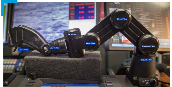
ROV pilots use this scale model to control ROV Deep Discoverer 's manipulator arm when collecting a sample.