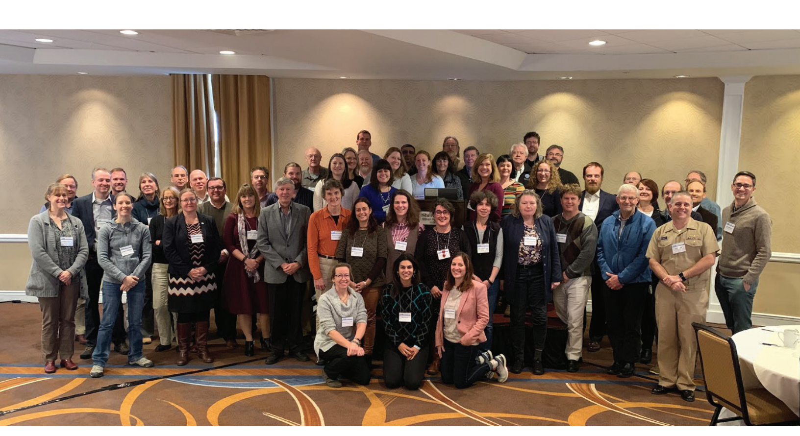
FIGURE 1. The ASPIRE Science Planning Workshop in Silver Spring, MD had over 50 attendees representing interests in Atlantic Ocean basin exploration and research from the U.S., Canada, European Union, Iceland, and Russia.

On November 15-16, 2018, over 50 experts in deep-sea exploration convened in Silver Spring, Maryland to discuss North Atlantic Ocean exploration interests and priorities as part of the NOAA Office of Ocean Exploration and Research (OER) Atlantic Seafloor Partnership for Integrated Research and Exploration (ASPIRE) Science Planning Workshop (Figure 1). Participants consisted of a mix of early to late career professionals and represented diverse backgrounds and interests from academia, industry, and government from across the United States, European Union, Iceland, Russia, and Canada. The objectives of the workshop were to determine Atlantic Ocean-based mapping and characterization needs from a variety of deep-sea exploration interests. Workshop outputs will guide exploration in the North Atlantic Ocean in 2019-2021, both through the development and execution of NOAA Ship Okeanos Explorer field seasons and through external partnerships with government, academia, industry, and non-governmental organizations. ASPIRE workshop results are intended to be used to inform other expeditions and platforms that are planning cruises in the North Atlantic.