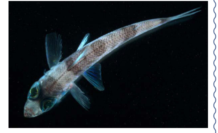
Under white light, the greeneye fish looks very different, but its green lenses are still apparent.