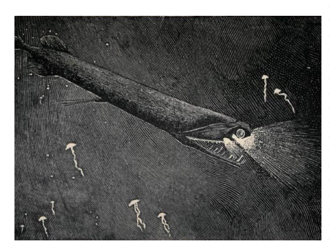
The black loosejaw, Malacosteus , is thought to use its suborbital photophores like search lights to find prey.

in marine organisms including bacteria, algae, cnidarians, annelids, crustaceans, and fishes.