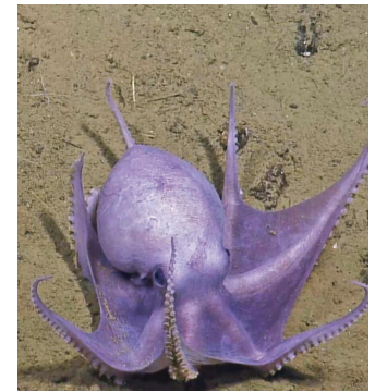
Our first octopus encounter on this expedition was with a Muusoctopus robustus with its arms outstretched.