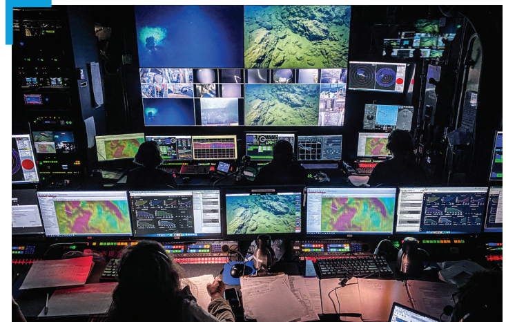
The control room aboard E/V Nautilus serves as the mission control room for undersea exploration.