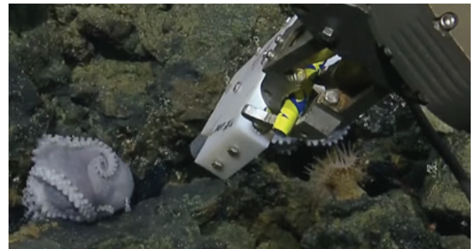
ROV Hercules takes a temperature reading with its mechanical arm of shimmering, warm water near a brooding octopus.

Where the warmer water meets cold water, it creates a "shimmering" effect. This is similar to heat radiating off a blacktop parking lot on a hot day. A stronger shimmer indicates higher flow rates or greater temperature differences.