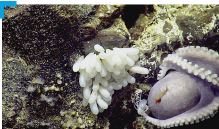
A cluster of white, oblong octopus eggs was observed during the dive. If you look carefully, eye spots are visible on some of them. A newly hatched octopus is just above the red shrimp in the lower left corner.

We gradually make our way up the volcanic cone, spotting more and more octopuses as we go. I count a dozen within the first few minutes. Some are balled up and some have their arms extended.