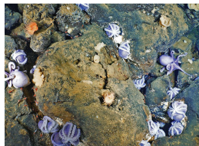
Many octopuses were tucked into rocks near shimmering seeps. More than 2,000 octopuses were observed on this expedition.

Original blog: https://nautiluslive.org/blog/2020/10/29/aboard-ev-nautilus-part-ii-welcome-octocone Expedition: https://nautiluslive.org/cruise/NA122 Explorer (bio): https://nautiluslive.org/people/marley-parker E/V Nautilus control room (image): https://nautiluslive.org/3Rgkkm2 Davidson Seamount (map): https://montereybay.noaa.gov/materials/mappages/davidsonmap.html Davidson Seamount (Wikipedia entry): https://en.wikipedia.org/wiki/Davidson_Seamount Octopus eggs (image): https://nautiluslive.org/resource/oviparous-ocean-animals-babies-eggs? Female Muusoctopus robustus octopuses (image): https://nautiluslive.org/blog/2020/10/03/oasis-deep-exploring-central-californias-national-marine-sanctuaries Muusoctopus robustus (image): https://nautiluslive.org/blog/2020/10/29/aboard-ev-nautilus-part-ii-welcome-octocone ROV Hercules : https://nautiluslive.org/video/2020/10/27/octopus-wonderland-return-davidson-seamount Octopus Wonderland (video): https://nautiluslive.org/video/2020/10/27/octopus-wonderland-return-davidson-seamount Welcome to the Octocone (image): https://nautiluslive.org/blog/2020/10/29/aboard-ev-nautilus-part-ii-welcome-octocone