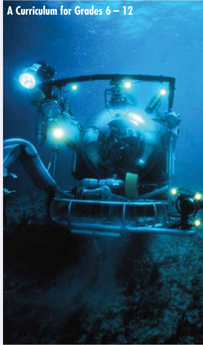
Johnson-Sea-Link Submersible