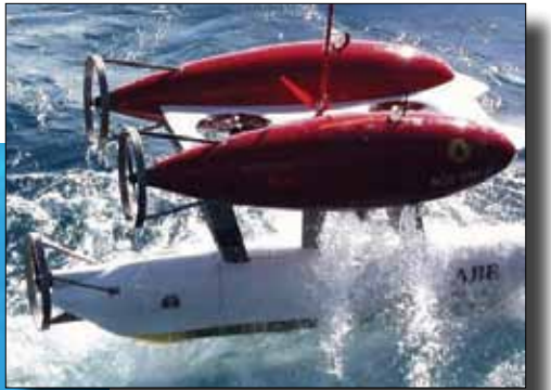
The Autonomous Benthic Explorer (ABE)