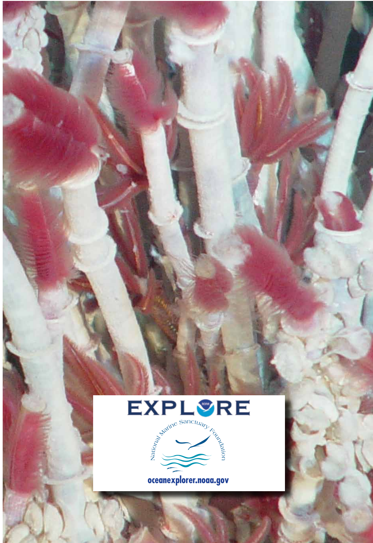
Tubeworms at vent site