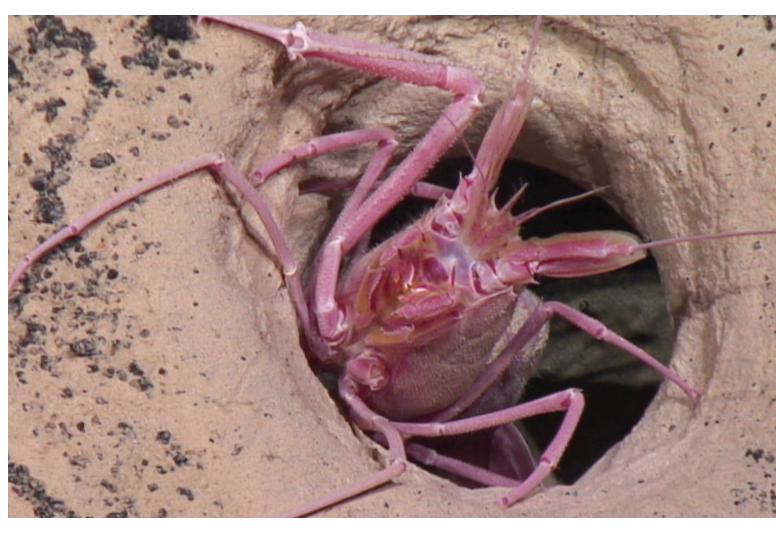
A huge blind lobster (possibly Thaumastocheles sp.) popping its head out of a hole on dive 8. This deep-sea lobster was seen guarding a series of large burrows with claws poised for action.

Seen while exploring a ridge feature at a depth of ~2,500 meters, the fish measured about 10 centimeters long. It is in the same order (Ophidiiformes) as cusk eels, but belongs to a distinct family (Aphyonidae); this is the first time that a fish in this family has ever been seen alive! With its transparent, gelatinous skin, which lacked scales, and its highly reduced eyes that lacked pigment, the fish was truly a remarkable, and ghostly, find.