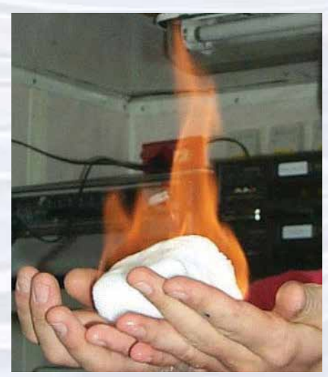
Methane hydrate looks like ice, but as the "ice" melts it releases methane gas which can be a fuel source.