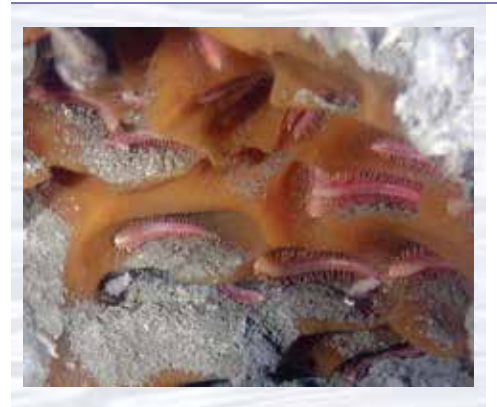
Iceworms (Hesiocaeca methanicola) infest a piece of orange methane hydrate at 540 m depth in the Gulf of Mexico. During the Paleocene epoch, lower sea levels could have led to huge releases of methane from frozen hydrates and contributed to global warming. Today, methane hydrates may be growing unstable due to warmer ocean temperatures. Image credit: Ian MacDonald. http://oceanexplorer.noaa.gov/explorations/06mexico/background/ plan/media/iceworms_600.jpg

The release of large quantities of methane gas can have other consequences as well. Methane is one of the greenhouse gases. In the atmosphere, these gases allow solar radiation to pass through but absorb heat radiation that is radiated back from the Earth's surface, thus warming the atmosphere. A sudden release of methane from deep-sea sediments could increase this greenhouse effect, causing Earth's surface to become significantly warmer.