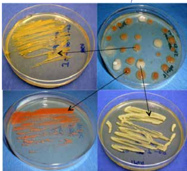
Laboratory cultures of deep-sea vent microbes: isolation and purification of organisms on solid agar media.

When an atom or molecule loses an electron it is said to be oxidized, and when an atom or molecule gains an electron it is said to be reduced. A reducing substance is a substance that reduces; in other words, it donates electrons. Similarly, an oxidizing substance is a substance that oxidizes; that is, it receives electrons (note that the terms oxidation, reduction, and redox may also be used in slightly different ways for some types of chemistry, but these distinctions are not important for this discussion). Most of the chemicals that are commonly found in hydrothermal vent fluids are highly reduced. In other words, they are electron-rich. This means that these chemicals can provide a source of electrons for chemosynthetic electron transport chains. Most chemoautotrophic bacteria have evolved to use specific chemicals as a source of electrons. For this reason, microbial communities at hydrothermal vents can be characterized by the types of electron donors that are present in the hydrothermal fluids that nourish these communities.