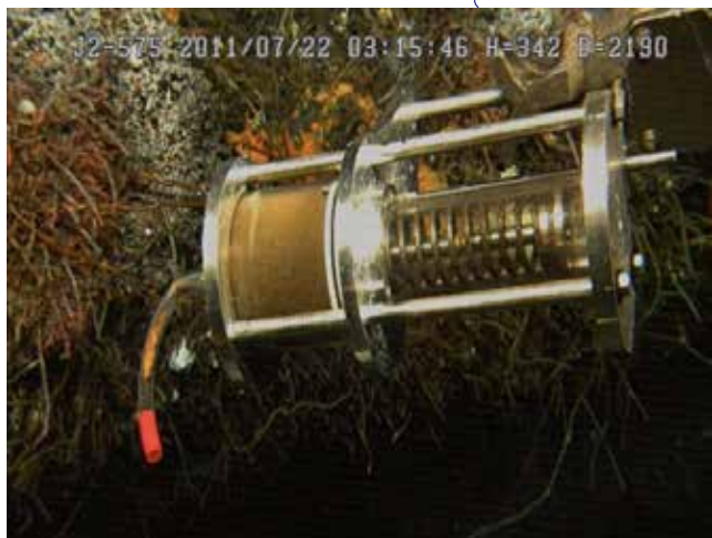
Syringe sampler used by ROV manipulators to collect microbial mat samples. Image courtesy of NOAA/NSF/WHOI.

http://oceanexplorer.noaa.gov/explorations/12fire/background/pharmacology/media/syringe_sampler.html