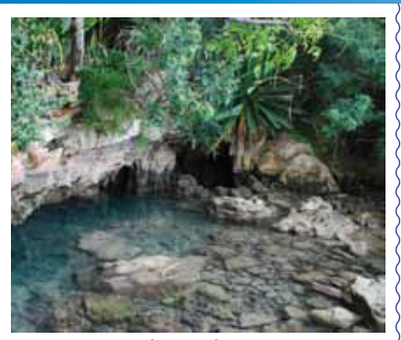
Entrance to one of Bermuda's caves.