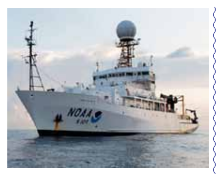
NOAA Ship Ronald H. Brown at sunrise in the Gulf of Mexico.