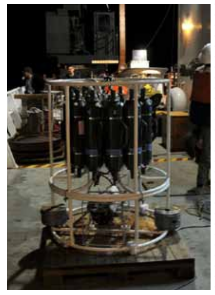
CTD rosette on deck ready for deployment. Image courtesy of NOAA, Lophelia II 2009. http://oceanexplorer.noaa.gov/ explorations/09lophelia/logs/sept1/media/ctd_on_ deck.html

• What processes control the occurrence and distribution of coldseep and deepwater coral communities in the Gulf of Mexico?