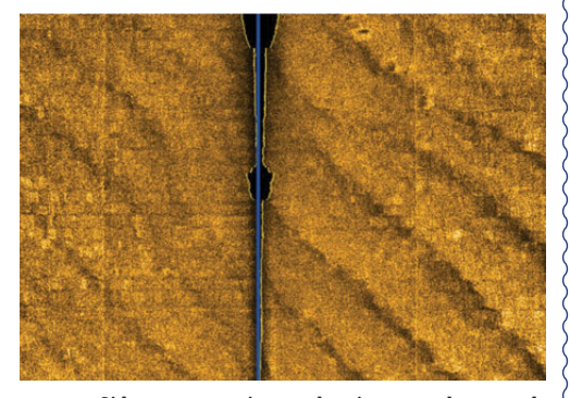
Side scan sonar image showing near shore sand ridges associated with the Last Glacial Maximum. The blue line in the center of the figure shows the track of the side-scan sonar.

When the first Americans arrived in Florida, sea level was much lower and there was more than twice as much dry land as exists today. The climate was considerably drier, and water was scarce. Not surprisingly, early American settlements that have been discovered in the state are almost always associated with a reliable water supply such as rivers