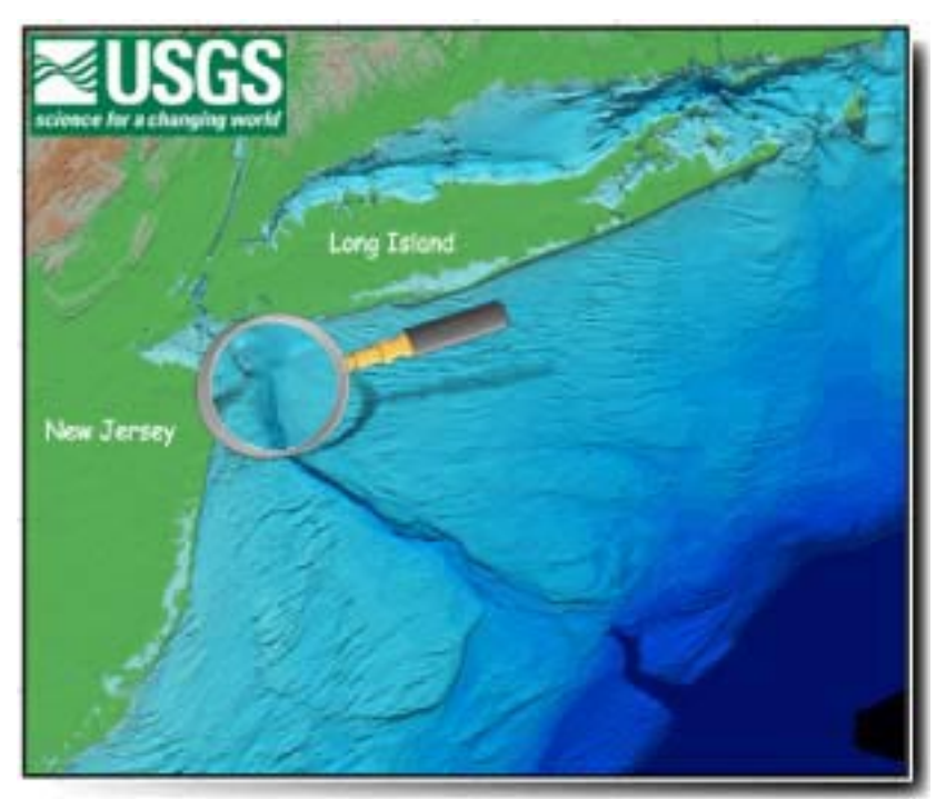
Figure 2. Bathymetry of the coastal ocean in the New York-New Jersey metropolitan region. The sandy, relatively shallow mid-Atlantic continental shelf is bisected by the Hudson Shelf valley, a submerged river valley containing muddy sediments that may act as a conduit for cross-shelf transfer of sediments.

tidisciplinary study in the New York-New Jersey region to characterize the sediments on the sea floor, map the distribution of contaminants in the sediments, and develop a predictive model for the long-term transport and fate of sediments and contaminants. This regional understanding of the seafloor geology and dynamics of these coastal sediments is needed by Federal, State, and local agencies for management and use of the coastal ocean, and by scientists to plan and conduct research and monitoring.