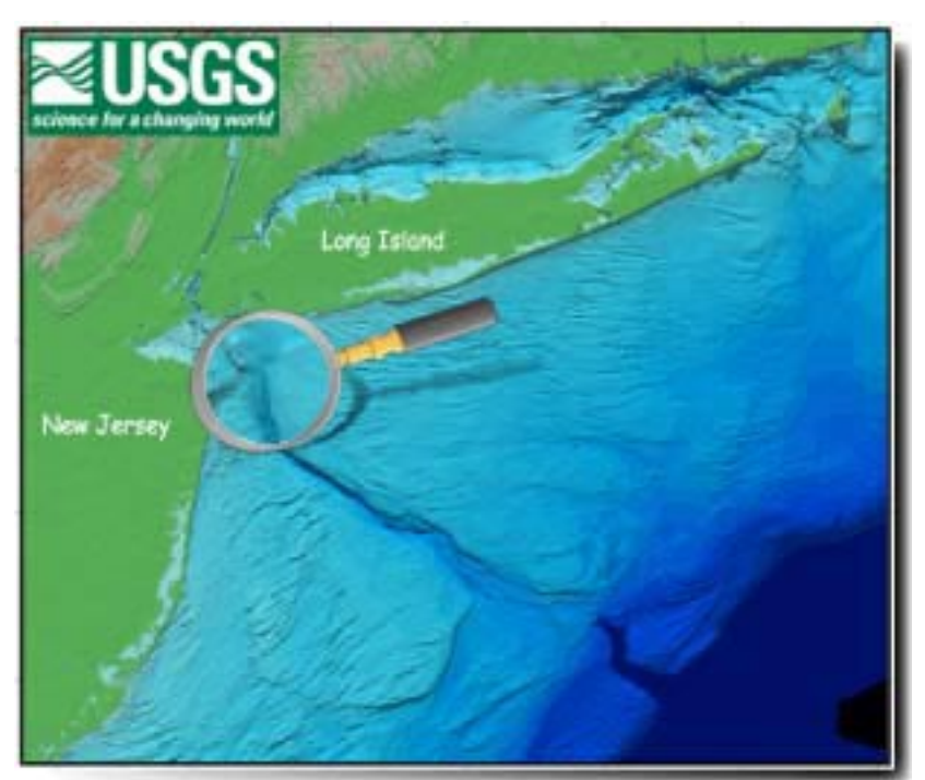
Figure 2. Bathymetry of the coastal ocean in the New York-New Jersey metropolitan region. The sandy, relatively shallow mid-Atlantic continental shelf is bisected by the Hudson Shelf valley, a submerged river valley containing muddy sediments that may act as a conduit for cross-shelf transfer of sediments.