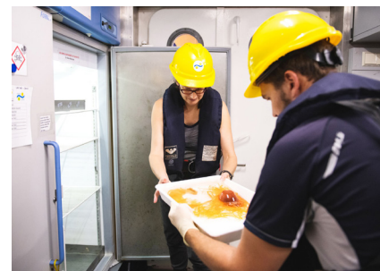
Scientists aboard the R/V Falkor quickly transfer a rare hydroid sampled from 2,497 meters (8,192 feet) deep to the sample refrigerator for preservation.