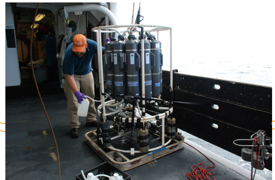
A tube is attached to each Niskin bottle on this CTD rosette to transfer water samples to plastic jugs for processing.