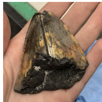
Fossilized tooth of a megatooth shark, Otodus megalodon , found mostly covered in a ferromanganese crust. Learn more about this surprise discovery!