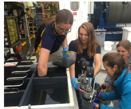
Biological and geological samples are taken from bioboxes aboard the ROV Hercules and placed into plastic bins for future processing.